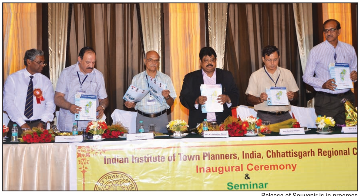
Release of Souvenir is in progress

from Kerala he underscored that the waterways are being used for transport purposes. On the issue of planning he pointed out that even if excellent plans are prepared, success of these plans depends on the implementation of these plans. Otherwise the whole exercise becomes futile. He also pointed out that let us not misuse water bodies by filling them for making them available for the development and building activities. He also added that there are 55 water bodies in Naya Raipur, however, we have ensured that these water bodies are well maintained and not destroyed. For this purpose we have to work together specifically with the planners who are dreamers for the cause of public, who visualize the common interest of masses and try to realize these dreams on the ground. He assured the delegates that through Naya Raipur project, the state government would implement the Plan in the spirit it has been conceived with a strong will for better cities and towns making them sustainable and inclusive.