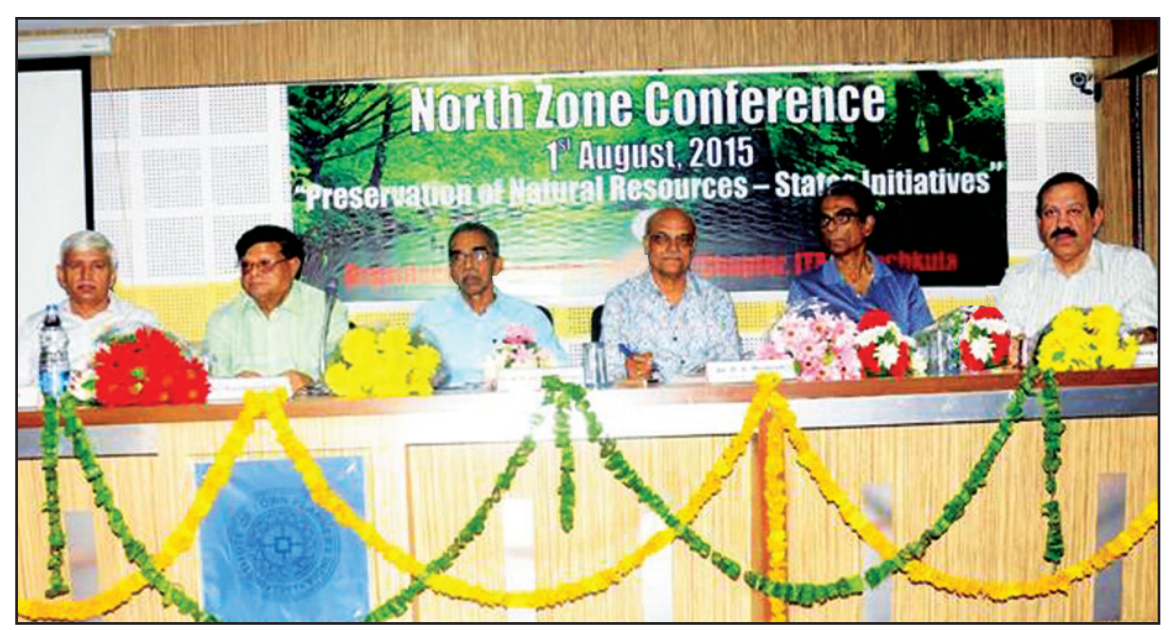
North Zone Conference is in progress at Panchkula

Haryana Regional Chapter of Institute of Town Planners, India organized the North Zone ITPI Zonal conference on 1 August 2015 at Panchkula. The theme of the conference was "Preservation of Natural Resources - States Initiatives".