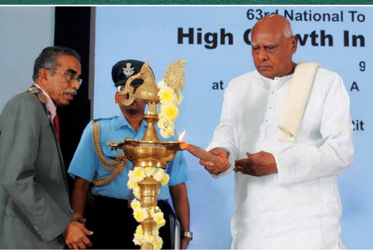
Lighting of the Ceremonial Lamp during Valedictory Session of 63rd NTCP Congress by H.E. Governor of Tamilnadu Dr. K. Rossiah