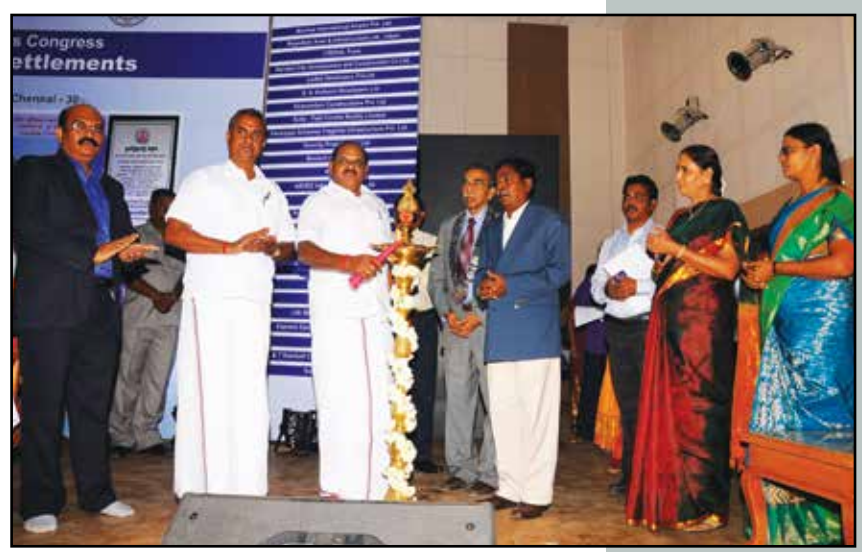
Inauguration of Congress by Thiru R. Vaithilingam, Honourable Minister for Housing and Urban Development, Government of Tamilnadu

Additionally, taking into consideration emerging trends of developing a self supporting residential township will be developed in Kadambur near Chennai on an area of more than 200 acres. It has been proposed to develop Kadambur Satellite Town by Chennai Metropolitan Development Authority as a city with excellent infrastructure.