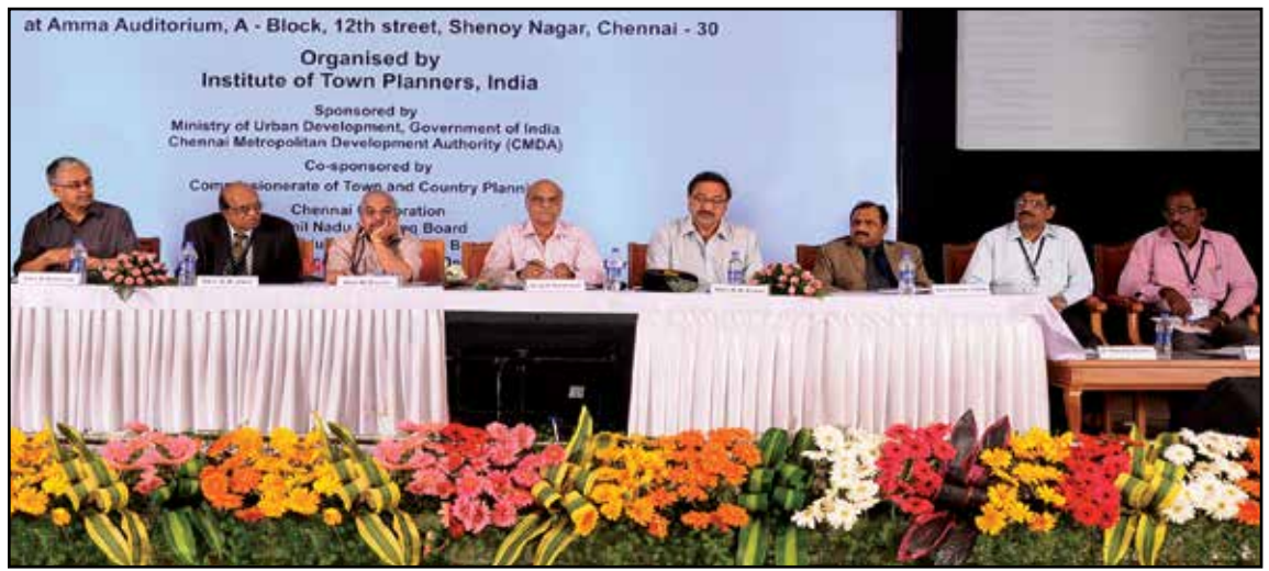
Workshop - II is in Progress