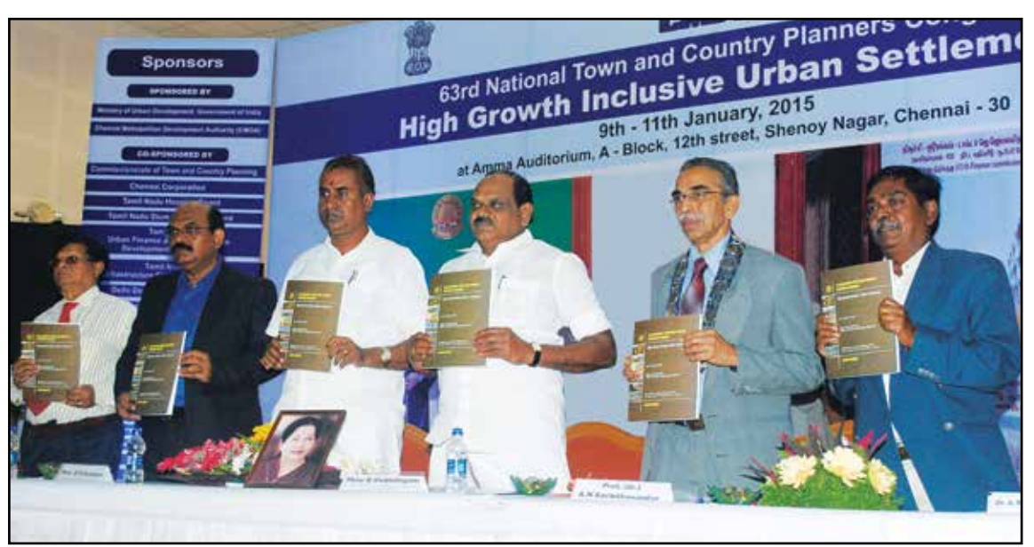
Release of Souvenir is in progress

construction of footpaths of international standard along 26 bus route roads which got national awards.