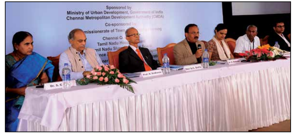
Workshop - III is in Progress