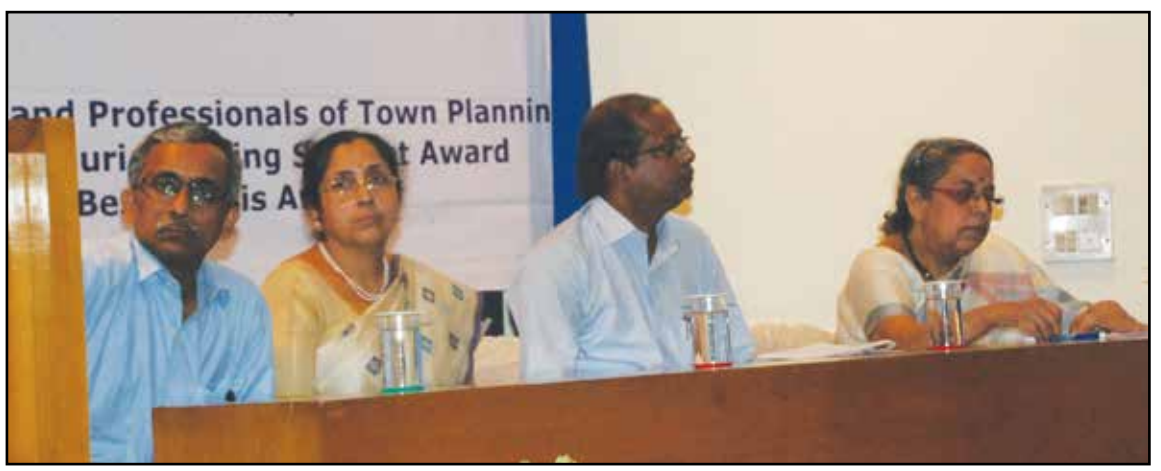
Celebration of World Town Planning Day - 2013 is in progress, at WBRC