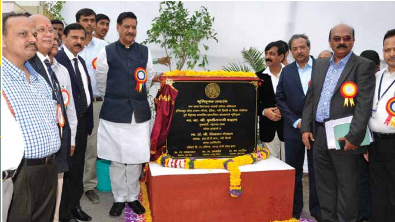
Shri Prithviraj Chavan, Honourable Chief Minister of Maharashtra Laying the Foundation Stone of Building for Pune Centre