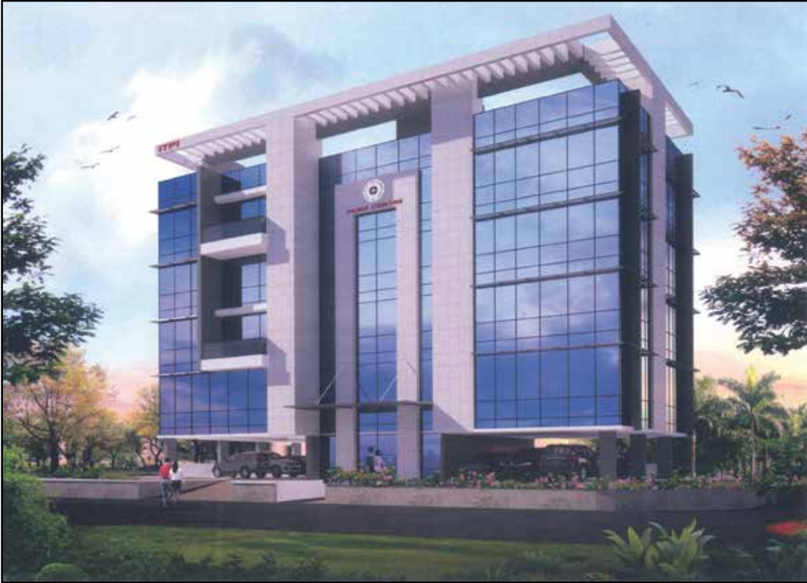
Proposed Building of Pune Centre, MRC (M) - ITPI

he thanked Honourable Chief Minister for agreeing to host 62nd National Town and Country Planners' Congress at Pune to coincide with Centenary Year of the Department of Town Planning and Valuation, Government of Maharashtra.