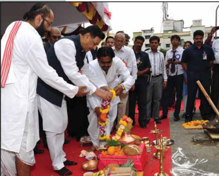
Shri Prithviraj Chavan, Honourable Chief Minister of Maharashtra Laying the Foundation Stone of Building for Pune Centre