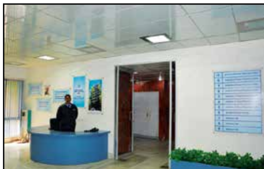
Entrance Foyer to Main Block