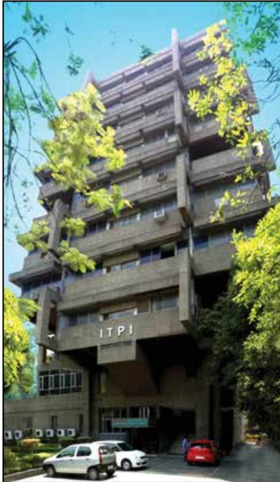
ITPI HQ Main Block

ITPI Office is now shifted to 4th Floor of the Main Block of ITPI Building. Member and visitors are requested to visit to 4th Floor for transacting any business with ITPI