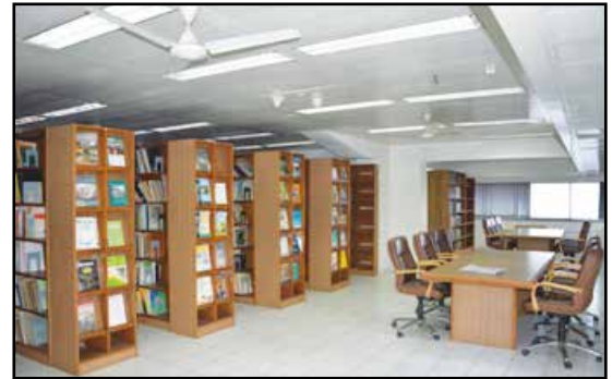
ITPI HQ Library