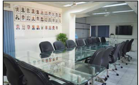
ITPI Board Room