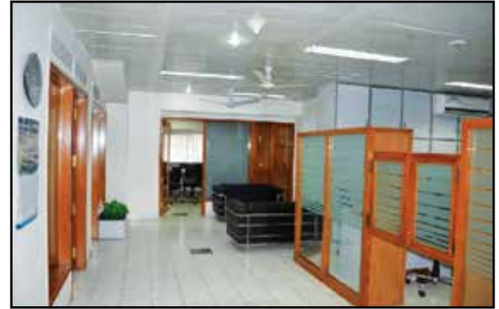
ITPI HQ Office