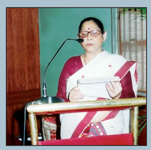
Mrs. Dolly Bora, Mayor, Guwahati Municipal Corporation giving the inaugural address

While inaugurating the Conference, Mrs. Dolly Bora, Mayor, Guwahati Municipal Corporation, reminded the planning fraternity, the need for sustainable approach to planning of infrastructure including transportation, power, solid waste management, etc. She further stated that for the successful implementation of master plans, plan implementing agencies should obtain the support of various