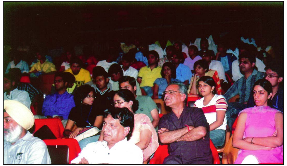
Participants of CONCORD 2006

to each other with a view to learning from mutual interaction among students and the faculty.