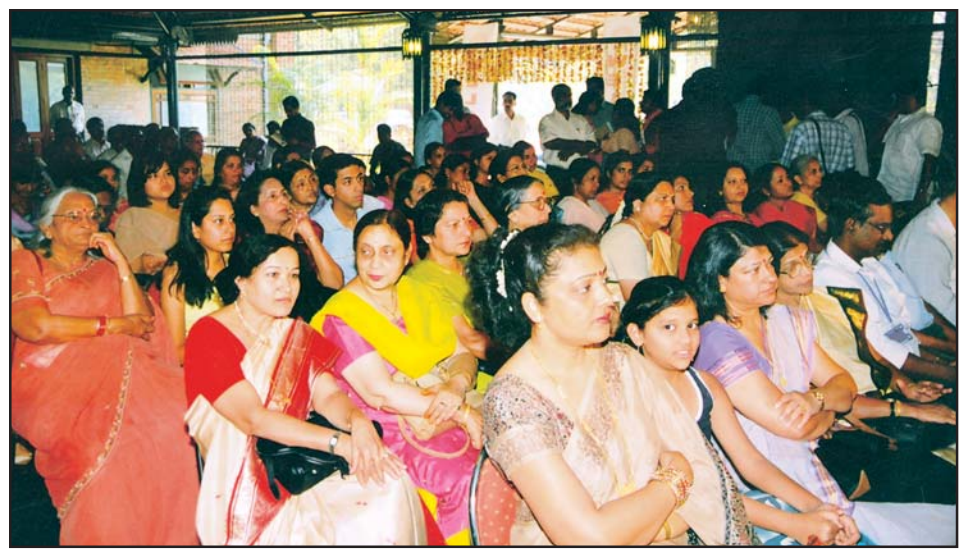
Audience in the Congress

of agricultural land to non-agricultural purposes, etc.