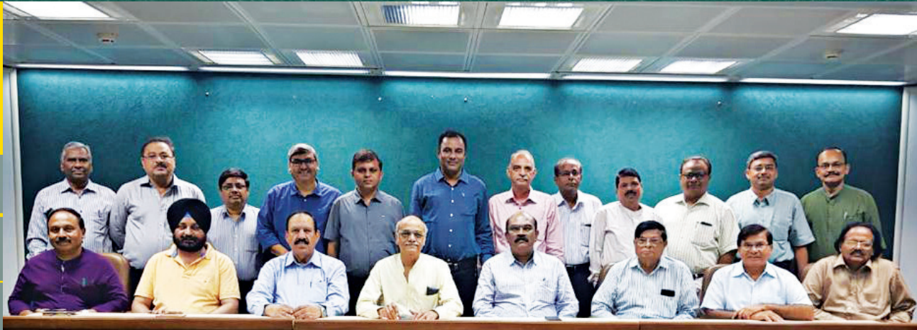
ITPI COUNCIL (2018-2019)