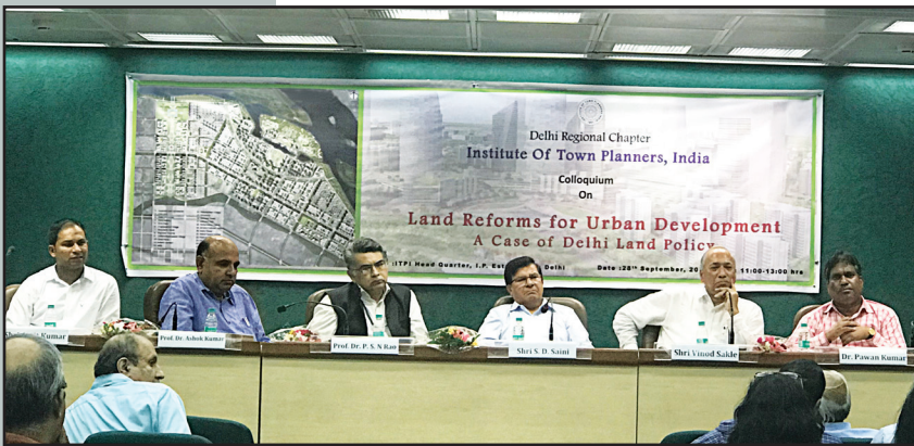
National Seminar is in Progress

Accordingly, three models of land pooling and development were worked out. The first model was given by Association of Metropolitan Development Authority (AMDA) on the request of DDA. The second alternative was provided by Planning Department of the DDA within the framework of norms of the Master Plan. The third option was worked out by a consultant for the DDA. For identification of most attractive model for the private sector and landowners, the DDA assigned the study to the National Council of Applied Economic Research (NCAER) Delhi. Based on economic parameters such as land cost, cost of EDC, cost of construction, contingency cost and reasonable IRR of 20 – 22 per cent, the NCAER prepared a model, which was deliberated among various stakeholders and after inviting objections and suggestions a new section in the form of Chapter 19 titled ‘Land Policy’ was added to the Master Plan for Delhi, 2021 and notified on 5th September, 2013.