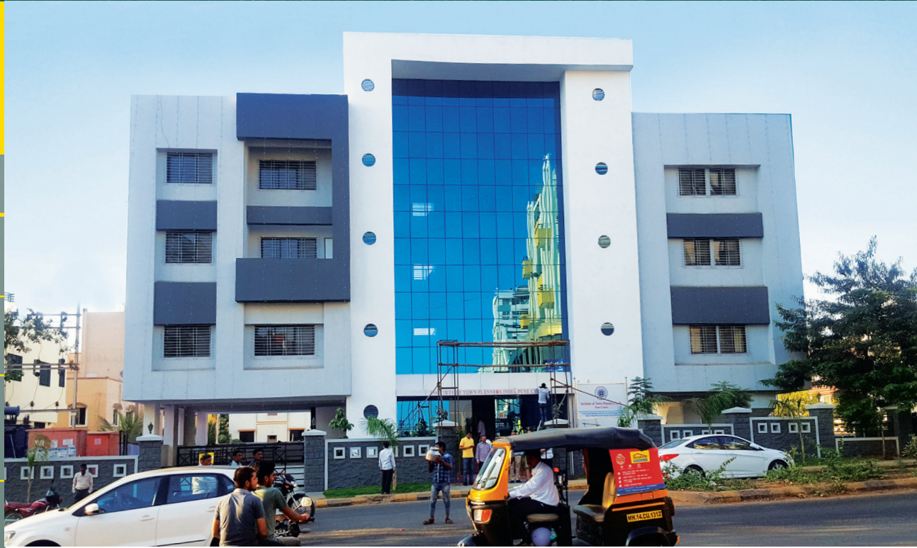
Pune Centre Building, Maharashtra Regional Chapter (Mumbai), ITPI