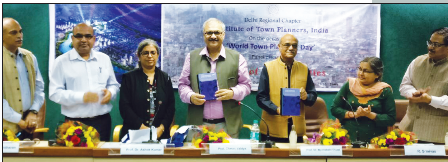
Celebration of World Town Planning Day - 2016 is in progress

Delhi Regional Chapter, Institute of Town Planners', India celebrated World Town Planning Day on 8th November, 2016 at ITPI HQs, New Delhi. On this