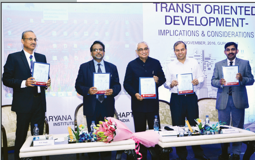
Workshop on TOD is in progress

component shaping urban development and living. Smart growth strategies such as Transit Oriented Development is extremely useful for Indian cities keeping in view the sprawl pattern of development being witnessed in our cities resulting in over dependence on personalised transport resulting in unsustainable mobility pattern culminating in externalities such as traffic congestion, air pollution, accidents, etc. In fact Transit Oriented Development (TOD) enables development that benefits from its proximity to a transit facility, which besides generating significant transit ridership also aims to combat traffic congestion and promotes creation of a network of well designed human scale focused around transit stations. He however pointed out that in order to effectively implement transit oriented development in our cities, there is a need to create TOD typologies, combine TOD with transportation demand management (TDM) measure and mainstream social development in TOD process. He further emphasised creation of a supportive institutional environment for leveraging TOD and vigorously pursue for sustainable finance mechanism for implementing TOD schemes.