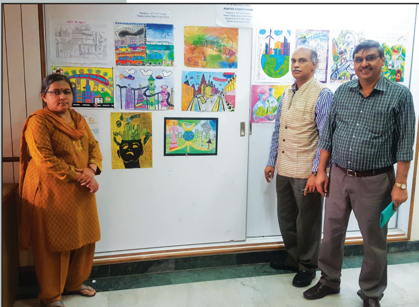
Jury is in Progress

The awards were distributed on the occasion of the World Town Planning on 8th November, 2016, organized by DRC, ITPI.