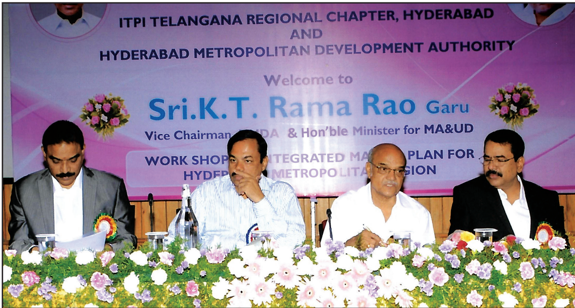
Workshop is in progress

empowered to consolidate plans prepared by Nagar Panchayats and also Gram Panchayats . It is given to understand that HMDA Integrated Master Plan will comprise of five existing master plans. If that is so, it is advisable to include not only urban areas but also include peri-urban areas. Otherwise peri-urban areas will develop fast in a haphazard manner and once developed, it would not be possible to demolish them.