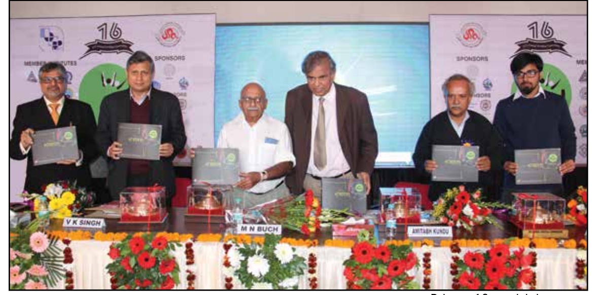
Release of Souvenir is in progress

forms the urban fabric of the city. Urban planning as a tool can bridge gaps in quality of life services between the main city and the peripheral areas.