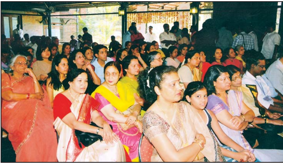
Audience in the Congress

of agricultural land to non-agricultural purposes, etc.