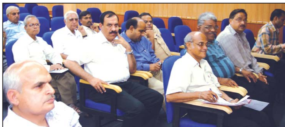
Annual General Meeting (2005), in Progress

While elaborating on the activities of the Council for 2004-2005, the Secretary General further noted that the Institute organized the 53rd National Town and Country Planners' Congress on the main