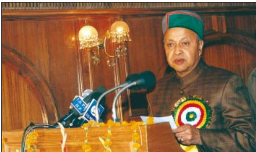
Shri Virbhadra Singh, Hon'ble Chief Minister, Himachal Pradesh addressing the delegates.

utilities could be provided in such a way that wastes are processed, recycled and reused. The developments in hill areas should be carried out with a view to exploiting as minimum of natural resources as possible, he opined.