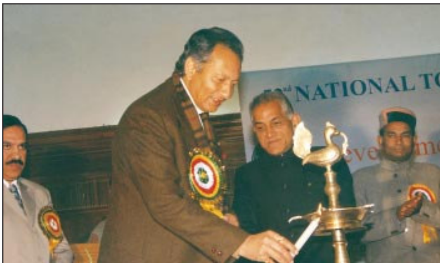
Major Vijai Singh Mankotia, Hon'ble Minister of Tourism and Civil Aviation Himachal Pradesh, lighting the lamp during inauguration.

activities associated with development of residential, commercial, institutional, workshop, garages, godowns, industries, hotels etc, without due consideration to fragile and sensitive ecosystems of the area and its past built heritage, etc, have done irreparable damaged to Shimla.