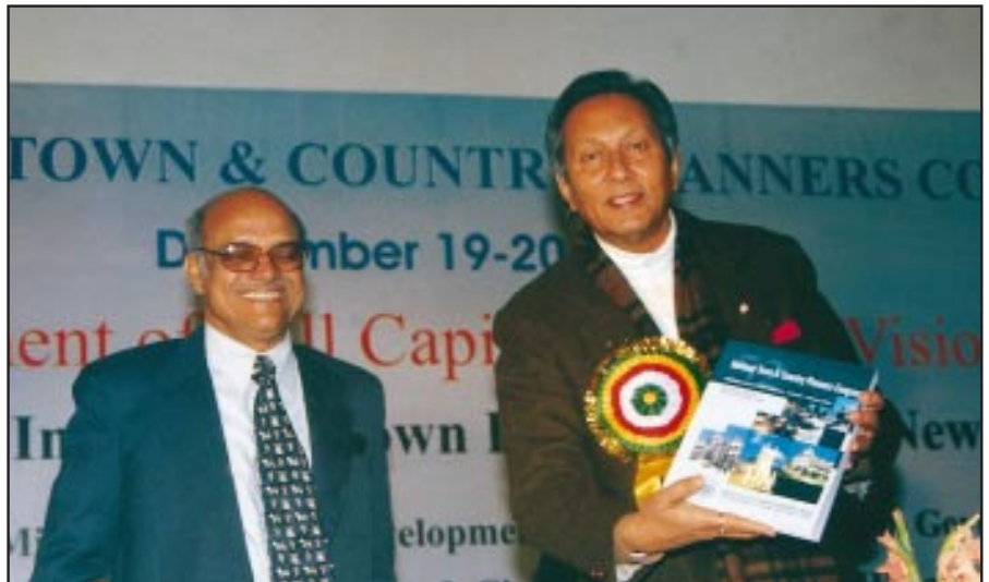
Major Vijai Singh Mankotia, Hon'ble Minister for Tourism and Civil Aviation, Himachal Pradesh releasing the Souvenir.