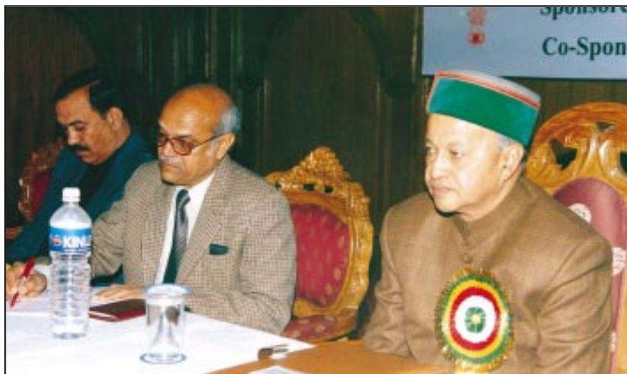
Shri Virbhadra Singh, Hon'ble Chief Minister of Himachal Pradesh, Shri D.S. Meshram, President ITPI, and Shri Pradeep Kapoor Secretary General, ITPI on the dias, during Valedictory Session.

1972. After a gap of 30 years, we are extremely happy to revisit Shimla the capital of Devbhumi - Himachal Pradesh today, on the occasion of the fifty second National Town and Country Planners' Congress for discussing the theme 'Development of Hill Capitals: Shimla – Vision 2025'. The sub-themes are: